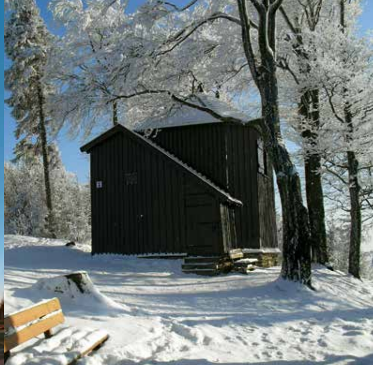
The Goethehäuschen (Goethe Hut) – here, near the Kickelhahn Tower, you can read Goethe’s “Wanderer’s Evening Song” at the wall.

The “Goethe Hut” is always open. On the inside wall, you find 16 translations of Goethe’s “Wanderer’s Evening Song”. In 1870, the original hut went up in flames because of the carelessness of people picking berries. It was restored four years later.