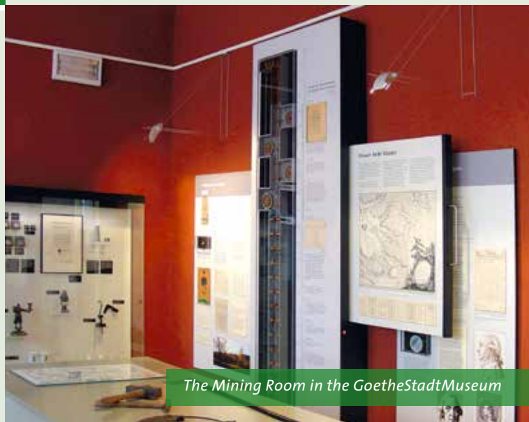
The Mining Room in the GoetheStadtMuseum

The trail now follows the Obertorstrasse to the Cemetery (2). On the left close to the entry, there is the grave of Corona