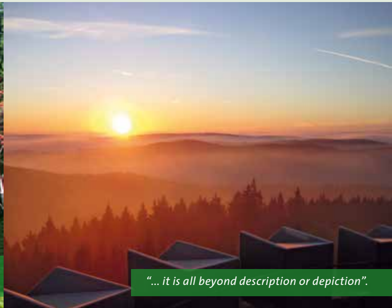
“... it is all beyond description or depiction”.