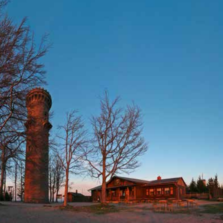
The Kickelhahn – from Ilmenau’s local mountain, there are breathtaking views across the Thüringer Wald.

This is where the trail reaches its highest point – on the Kickelhahn with 861 m a.s.l. Upon nightfall of September 6th, 1780, Goethe wrote on the inside of the Goethehäuschen (Goethe Hut), then a hunting cabin: “Wandrer’s Nachtlied” (Wanderer’s Evening Song):